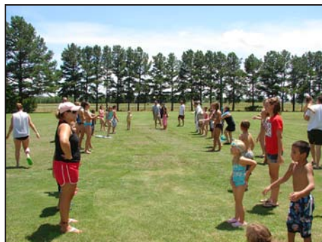
Family Fun Day 08